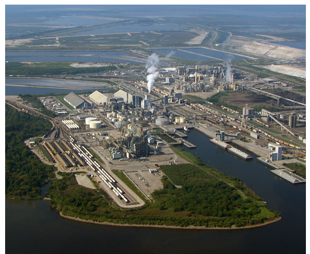
Top: White Springs, FL Facility Middle & Bottom: Aurora, NC Facility